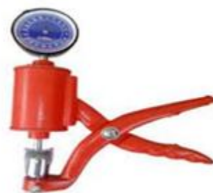
Fig 3. Monsanto hardness tester

To find out how long it took for the sweets to dissolve completely, we used a USP disintegration apparatus. We put hard-boiled sugar lozenges in each tube and timed how long it took for them to dissolve completely in a phosphate buffer at 37°C with a pH of 6.8.