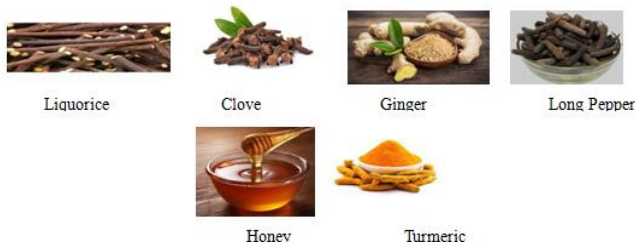
Fig 2. Ingredients