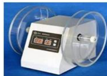
Fig 4. Friability