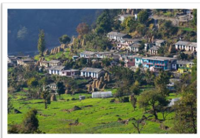
Fig. 6 Munsiyari village

To ensure the preservation of the unique architectural heritage and traditional knowledge system, the following steps should be taken: