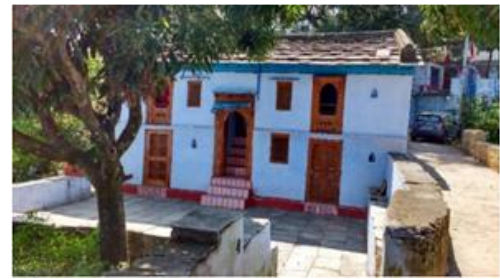
Fig.4 In place of daan (semi-open room on the ground floor) closed rooms are constructed