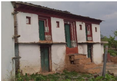
Fig.2 Garhwali traditional house