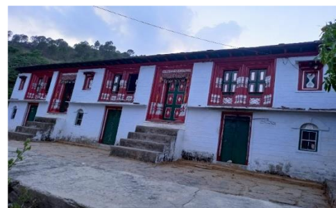
Fig. 1 Kumaoni traditional house