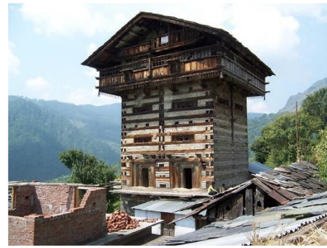
Fig.3 Koti Banal style, Uttarkashi