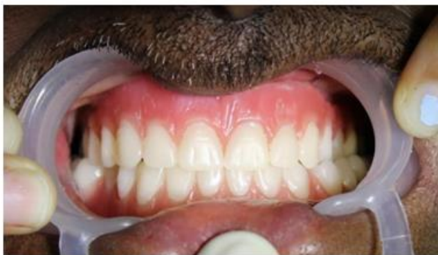
Figure 9. Cross arch teeth arrangement