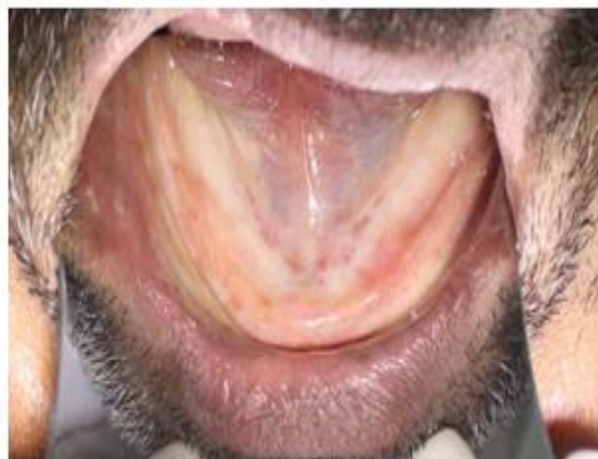
Figure 4. Mandibular Arch