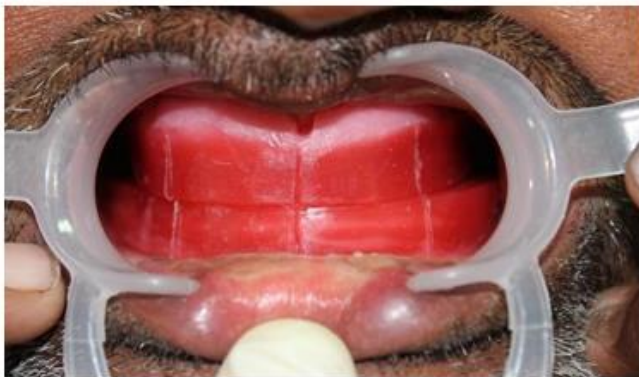
Figure 8. Maxillomandibular relationship