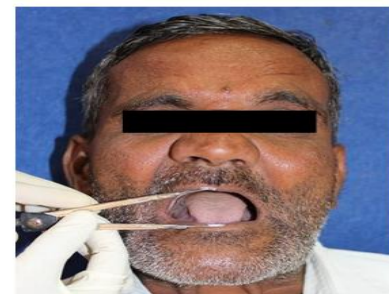
Figure 1. Reduced mouth opening