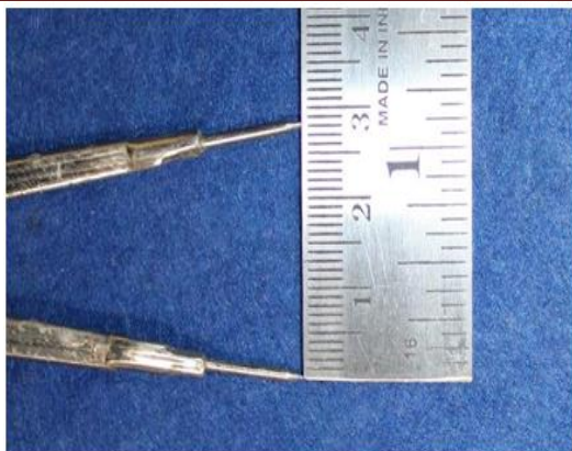
Figure 2. Measurements