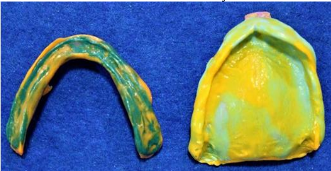
Figure 7. Maxillary FI made using C silicone impression material single step without border molding