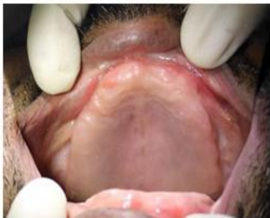
Figure 3. Maxillary arch