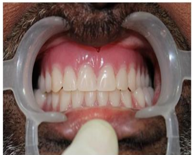
Figure 12. Finished polished Final denture intraorally