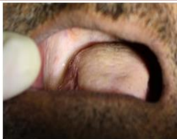
Figure 5. Palpable fibrous bands