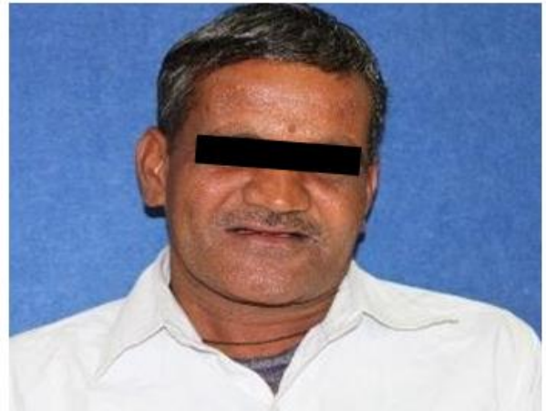
Figure 10. Pre operative